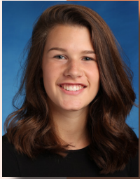
Prime Minister: Kianna Mohns