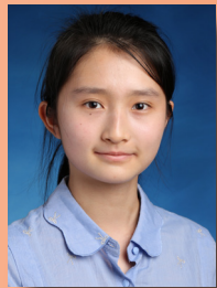
Minister of Finance: Ever Hu