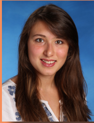
Deputy Prime Minister: Kim Tosi