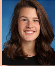
Prime Minister: Kianna Mohns